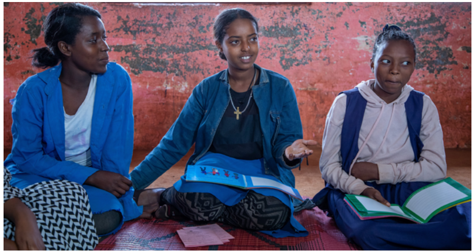
Participants in Bekeshe (Her Space)

Twice a week, the girls attend sessions on various topics, including sexual and reproductive health, gender equality, and women empowerment. As a result, both girls advocated for better treatment at home. "I am the only girl in the home, and all the household chores were on me. After the training, I convinced my brothers that it was unfair for me to do everything and that they should help. They agreed. I used the tools and approaches I have