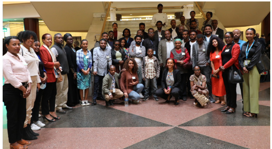
International Day of Persons with Disabilities was commemorated

The event also saw a consultation with leaders and representatives of Organizations of People with Disabilities (ODPs) on opportunities and challenges facing people with disabilities in Ethiopia.