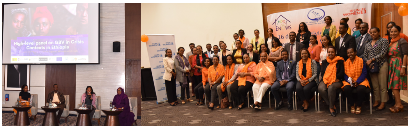
UN Women, UNFPA and UNICEF in collaboration with partners commemorate 16 Days of Activism

UN Women, UNFPA and UNICEF in collaboration with government counterparts, CSOs, and other development partners, commemorated 16 Days of Activism under the UNiTE campaign theme for 2023 Invest to Prevent Violence Against Women and Girls.