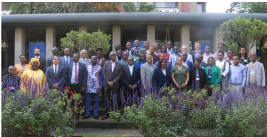
WHO organizes a workshop on Health Technology Assessment (HTA) for representatives of selected member states in the African region

In a landmark event, the World Health Organization (WHO) organized a 'historical' workshop on Health Technology Assessment (HTA) for selected member states in the African region.