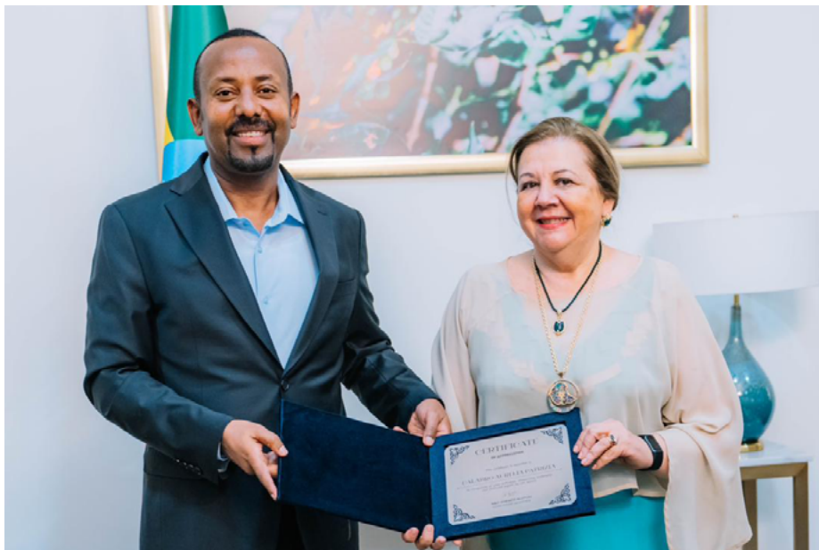
UNIDO Regional Director and Representative to Ethiopia bidden farewell