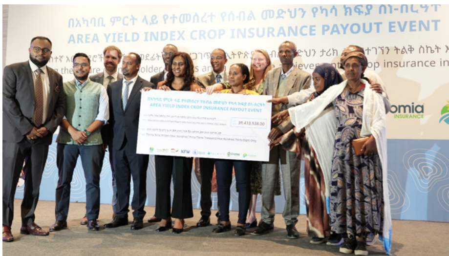
WFP advocates for integrated climate risk management instruments such as insurance to protect farmer's investments and help them recover from crop failures

Funded by Kreditanstalt für Wiederaufbau (KfW), the partnership between ATI, WFP, and Pula helps realize Ethiopia's Largest Crop Insurance Program that aims to secure the future of smallholder farmers. As part of this initiative, the Oromia Insurance is to pay 39 million ETB to smallholder farmers.