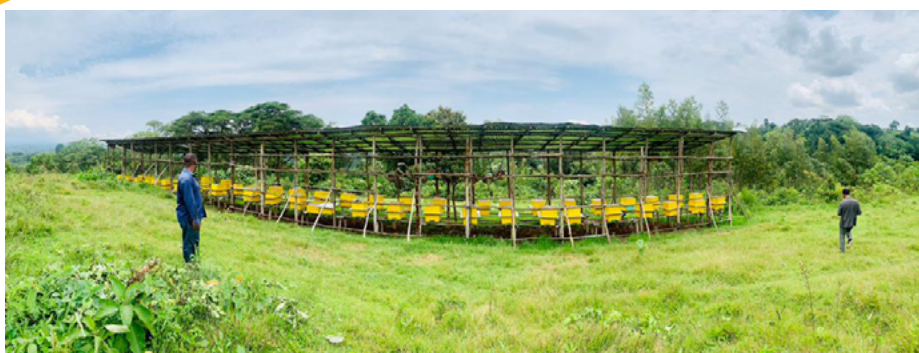
UNIDO strengthens honey value chain for greater market access

UNIDO's support to ensure the capacity of quality compliance of the honey value chain has led to enhanced market access for Ethiopia.