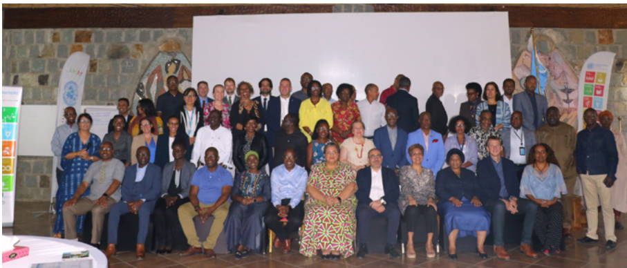
The UN Country Team meeting aims to develop a shared understanding of the country context and have agreement on key priorities in support of Ethiopia

The United Nations in Ethiopia held its annual strategic meeting with a focus to identify priorities for the UN collective response to help Ethiopia address its national priorities and gaps in its pathway towards meeting the Sustainable Development Goals (SDGs).