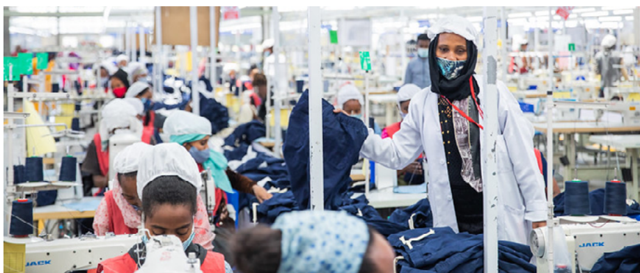
Technical and leadership skills training has helped in empowering new line managers in Hawassa industrial park

Technical and leadership skills training has helped in empowering new line managers in the labour-intensive textile and garment industry in Hawassa industrial park.