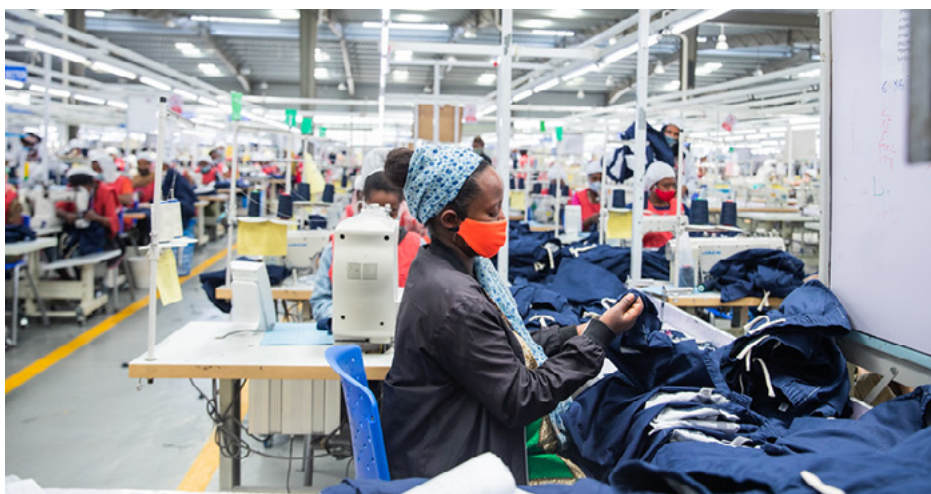
Workers and employees' associations, workers and employers in Hawassa Industrial Park and industrial zones improve relations towards exploring mutual interest

With continuous engagement with associations (of workers and employees), workers and employers in Hawassa Industrial Park and industrial zones in the Sidama