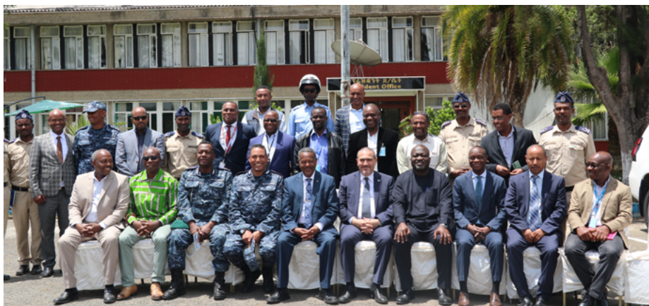
UN Resident and Humanitarian Coordinator visits Ethiopian Police University