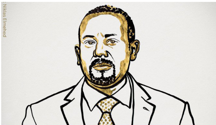
Abiy Ahmed Ali

“Our warm congratulations also go to the Government and people of Ethiopia. This honor is richly deserved and could not be more appropriate.”