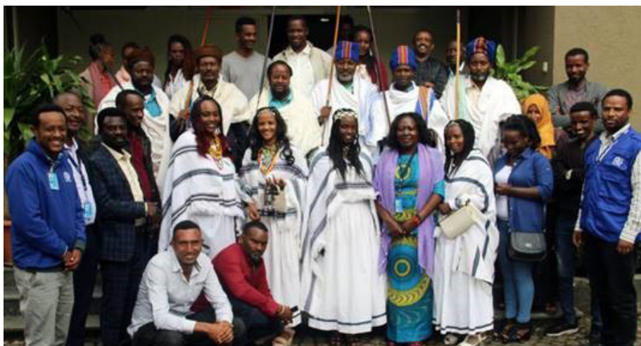
Aba Gedas and officials take part in peacebuilding talks

IOM’s peacebuilding meeting took place on 24 August in Shashemene, Ethiopia, funded by the UN Peacebuilding Fund (PBF). The event may be considered historic as it brought together both sides, with six Aba Gedas (three from each zone) alongside four Hadha Siqes (respected peacemaker mothers) who sat at one table to discuss ways to strengthen the peace initiatives that began five months ago. “This workshop is a platform that has brought children of