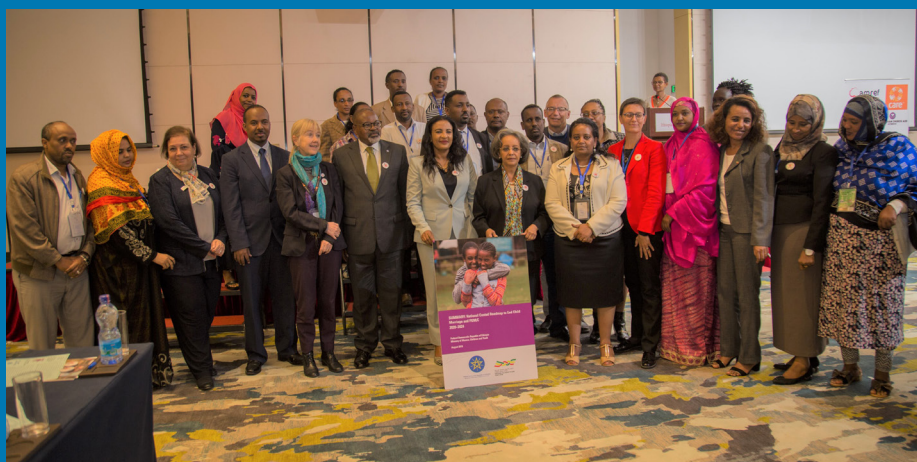
Ethiopia launches a five-year, US$ 94 million plan to end child marriage and FGM

"For Ethiopia to meet the Sustainable Development