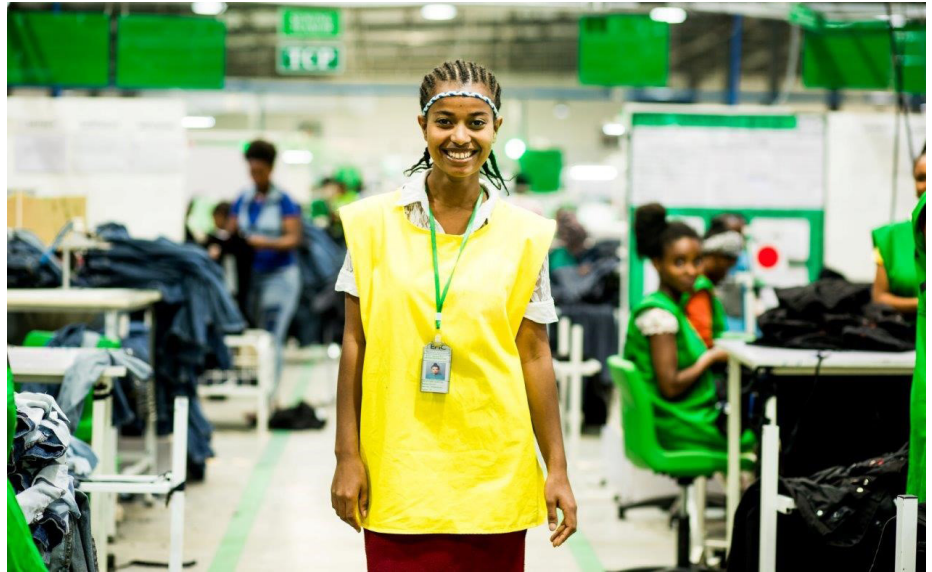
Sega-Setu, a quality auditor in one of Ethiopia's garment and textile industry

“The most important thing is to have a goal. For me, it is clear