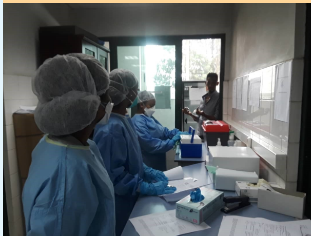
WHO support the strengthening of COVID-19 laboratory sample management