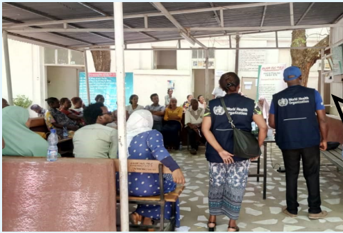
WHO conducted IPC training to health workers of Dire Dawa isolation center