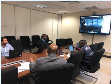
WHO facilitating the COVID-19 Humanitarian Country Team meeting