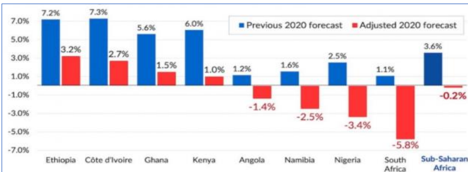
Fig. 2: Comparison of the African GDP forecasts prior and after COVID-19